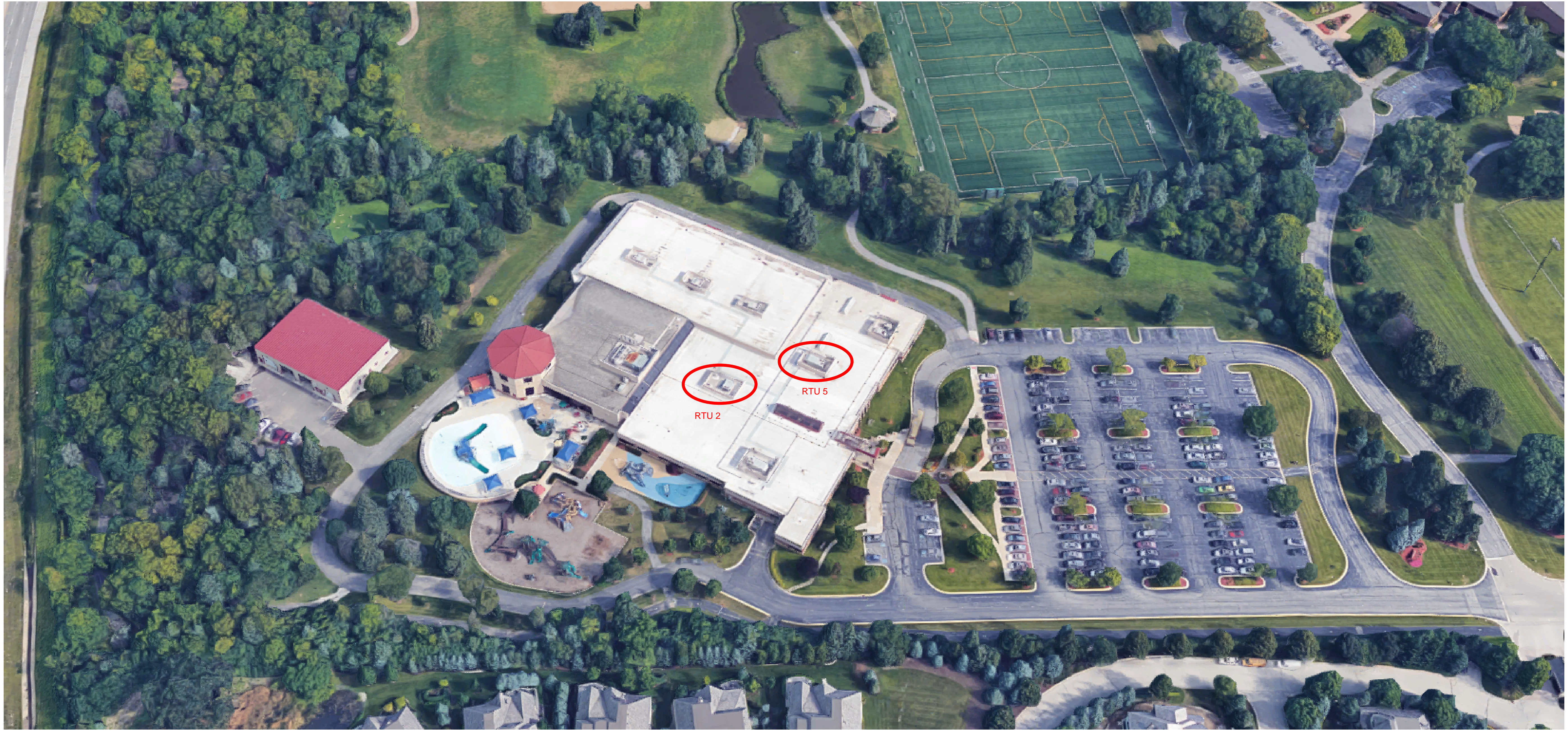
AERIAL SITE PLAN